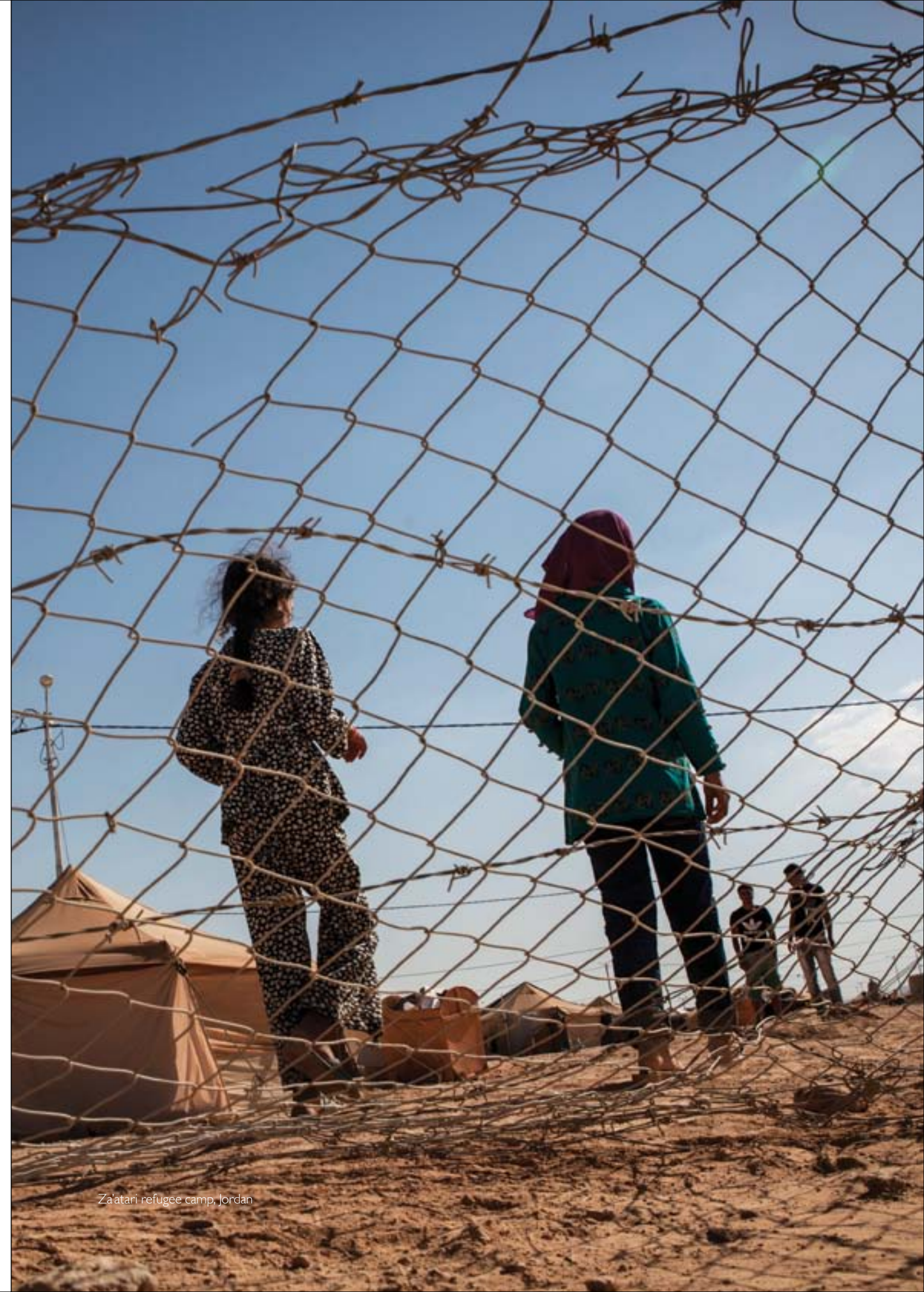
Za'atari refugee camp, Jordan