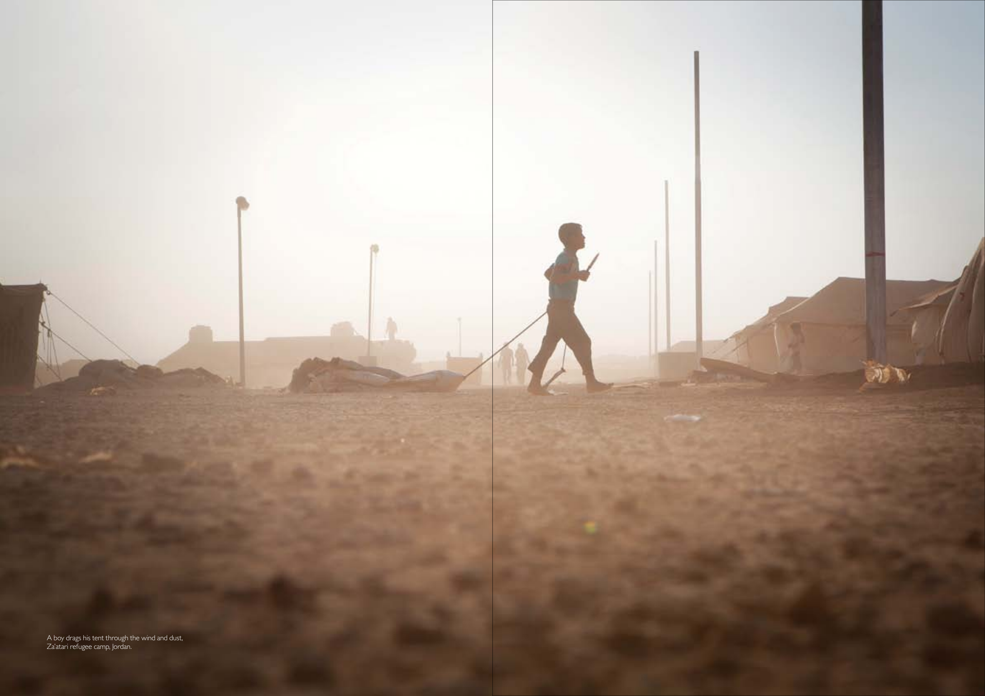
A boy drags his tent through the wind and dust, Za'atari refugee camp, Jordan.