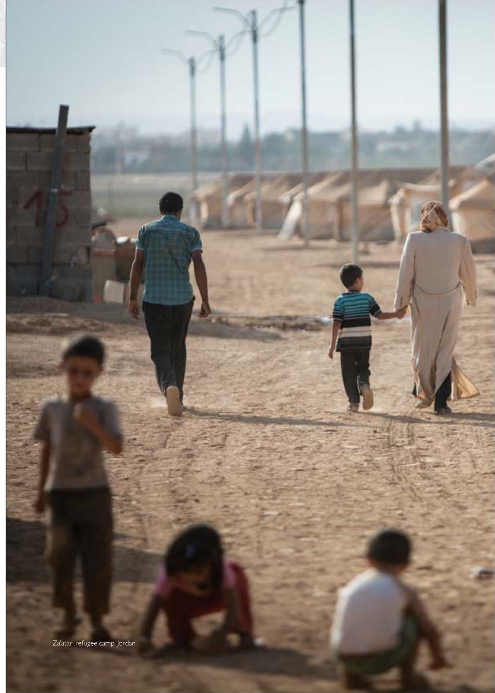
Za'atari refugee camp, Jordan

I thought that surely, after this, there would be no more shelling. I was wrong – there were more shells, more rockets, and then some shooting. At the beginning of the massacre there were no snipers, but then they came in. It was then that we realised we couldn’t bury everyone separately, it was too dangerous. So we decided on a mass grave for the 220 bodies.